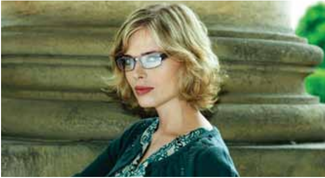
Without Diamond Finish multi-coat