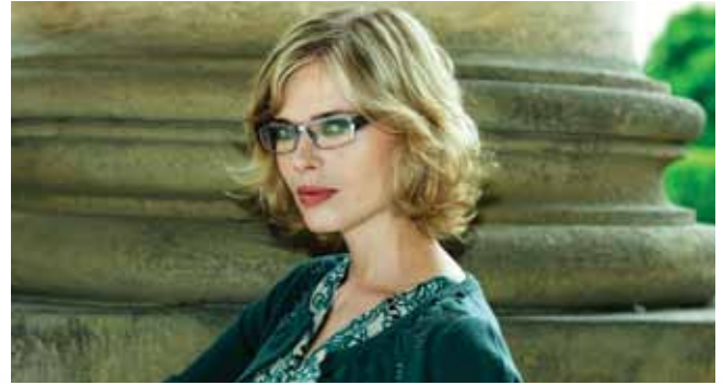
With Diamond Finish multi-coat

The wear and tear of everyday life can scratch and diminish the quality of your glasses. Diamond Finish multi-coated lenses are designed to completely protect you from life's everyday mishaps. The advanced technology of Diamond Finish provides you with the highest scratch resistance available, ensuring long term durability and excellent performance.